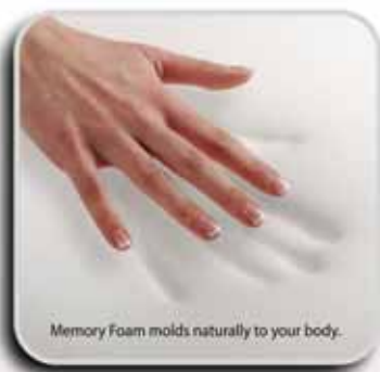
Memory Foam molds naturally to your body.

Experience the joy of restful sleep with visco elastic foam that's scientifically designed to relieve pressure points while it cradles your body in luxurious comfort .